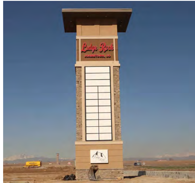
Monument sign under construction. Project will have two (2) 80' tall and one (1) 52' tall monument signs strategically placed around the center

Size and layout can vary based on user needs