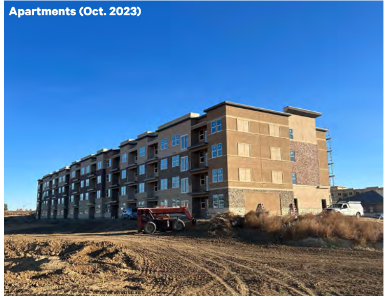
Apartments (Oct. 2023)