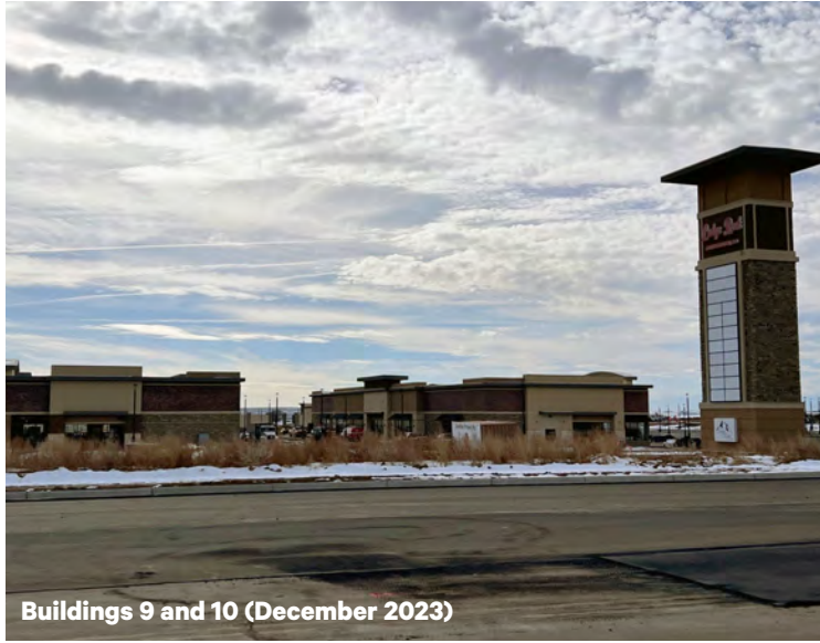
Buildings 9 and 10 (December 2023)